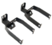
ADJUSTABLE HANDLE FOR FIXED MOUNTING