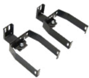
ADJUSTABLE HANDLE FOR FIXED MOUNTING