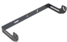
ADJUSTABLE HANDLE FOR FIXED MOUNTING