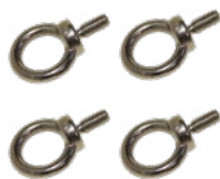
EYE BOLTS FOR SUSPENDED MOUNTING